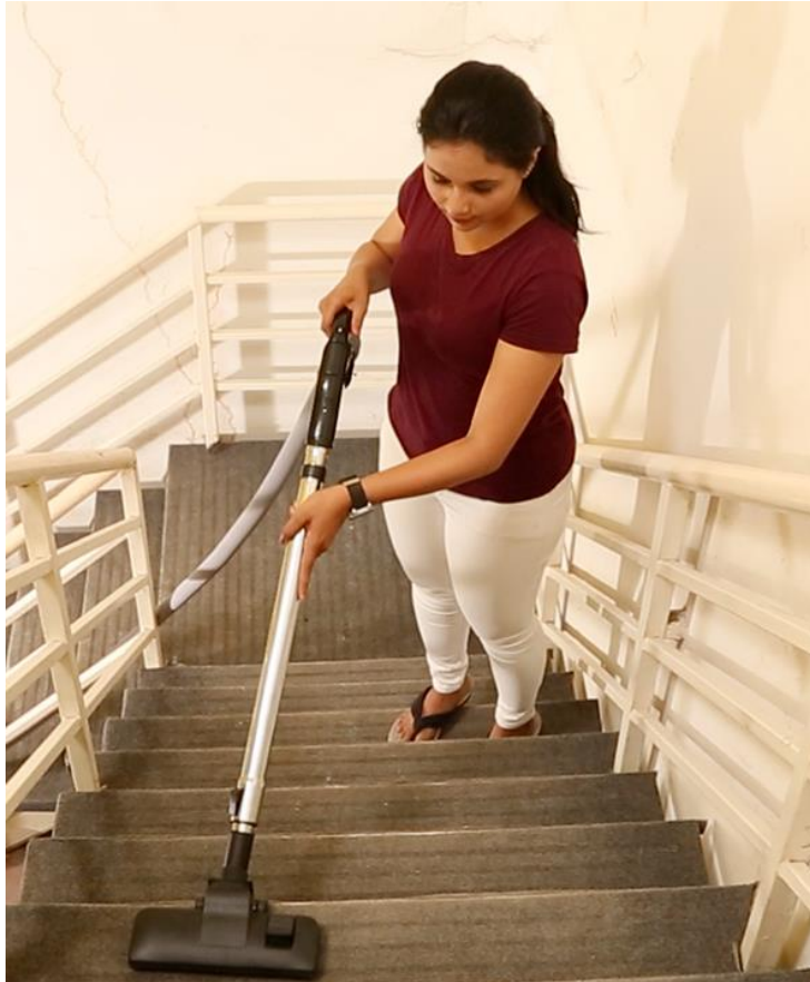
PERFECT FOR CLEANING STAIRS