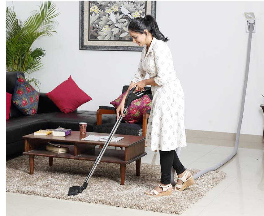
IDEAL CLEANING SOLUTION FOR FLOOR CARPETS, UPHOLSTERY, SOFA'S AND FURNITURES